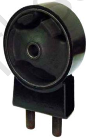
B092-39-050 Engine Mount for Mazda Laser