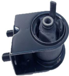
B25D-39-050C Engine Mount for Mazda BG323 Protege 1.6L 1.8L AT MT 1998-2002