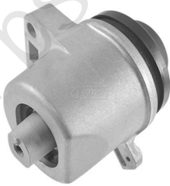
EH48-39-060 EH44-39-060 Engine Mount Right Side RH