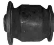
B459-34-470 AUTO RUBBER BUSHING FOR Mazda BG323