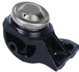
GJ27-39-060 Engine Mount for Mazda GD626