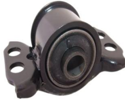
LA01-34-230A Control Arm Suspension Bushing for Mazda