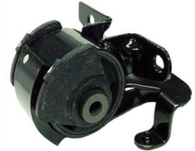
B25E-39-070D Engine Mount for Mazda Premacy Protege 1.6L 1999-2003