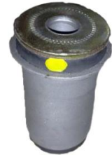
S24A-34-470 AUTO RUBBER BUSHING FOR Mazda E1800