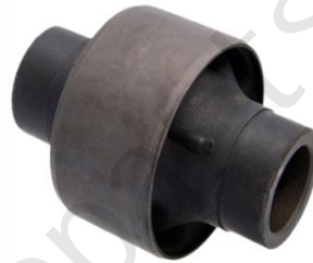
LC62-34-460B Control Arm Suspension Bushing for Mazda