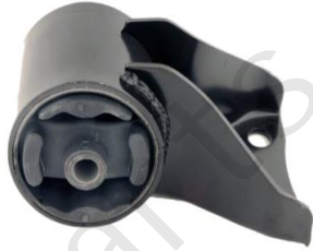
6446 GD7A-39-040A F42Z-60-68B Engine Mount for Mazda Probe 2.0L 1993-2002