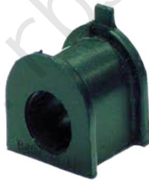
B459-34-156 AUTO RUBBER BUSHING FOR Mazda 323 ID=20mm