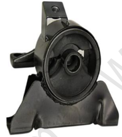
6481 BJ0N-39-06YE Engine Mount for Mazda Protege 1.8L 1999-2003