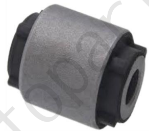
TD11-28-300D Control Arm Suspension Bushing for Mazda