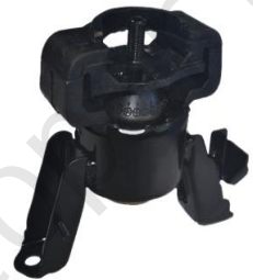
BC1F-39-060 Engine Mount for Mazda 323 Protege 1.5L 1995-1998