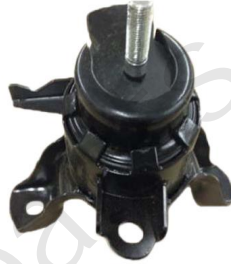
LD47-39-060B C AL BL A4409 A4409HY EMT9527 Hydraulic Front Right Motor Mount for Mazda MPV 2.5L