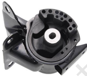
EH46-39-070B EH44-39-070A B TD11-39-070 LEFT ENGINE MOUNT FOR