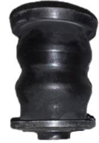
KA10-34-470A AUTO RUBBER BUSHING FOR Mazda GD626 TTL