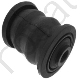
KA10-34-470A Control Arm Suspension Bushing for Mazda