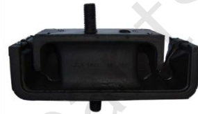
H115-39-040 Engine Mount for Mazda E18 B20