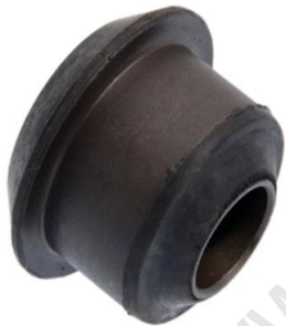
S47P-34-710A Control Arm Suspension Bushing for Mazda