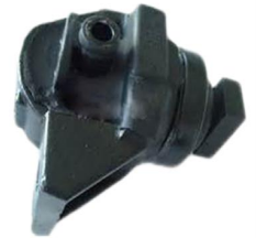
GA2G-39-060 GA2C-39-060 Engine Mount for Mazda