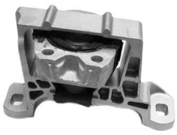
B32T-390-60A Engine Mount for Mazda 3 2004-2010