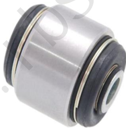
T001-34-42YB Control Arm Suspension Bushing for Mazda