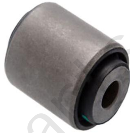
GS1D-28-500A Control Arm Suspension Bushing for Mazda