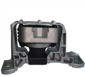
3M51-6F012-BG BBM4-39-060C Engine Mount for Mazda 3 2.0L Ford Focus C-

Email: manager@rbsautoparts.com Tel:+86-13222800878