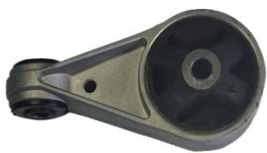
HB00-39-040 Engine Mount for Mazda E18 B20