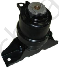
7237H EC01-39-060C Engine Mount for Mazda Tribute 2001 2WD 4WD Ford Escape