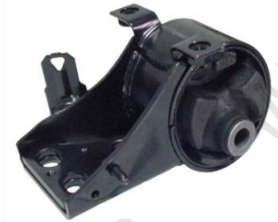
GJ21-39-070 Engine Mount for Mazda 626