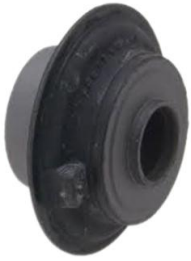
GJ6A-28-890A Control Arm Suspension Bushing for Mazda

Email: manager@rbsautoparts.com Tel: +86-13222800878