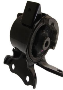
GJ6G-39-070B Engine Mount for Mazda