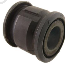
GS1F-32-123 Control Arm Suspension Bushing for Mazda