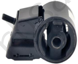
GJ23-39-050C Engine Mount for Mazda GD626