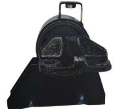
HB00-39-06Y Engine Mount for Mazda E18 B20