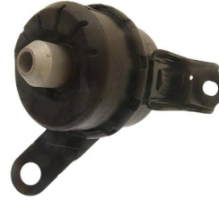
GS2P-39-060A GS2P39060A - Right Engine Mount For Mazda