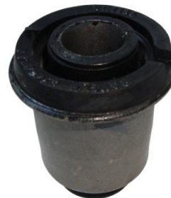
UH71-34-470 AUTO RUBBER BUSHING FOR Mazda Fighter 2WD 4WD Ford