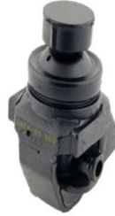
6460 GA2B-39-060B GA2F-39-060B Engine Mount for Mazda 626 MX 1993-2002