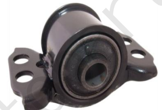
LA01-34-230A Arm Bushing Engine Mount for Mazda