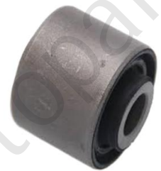
BBM2-28-C10 Control Arm Suspension Bushing for Mazda