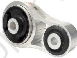
EH48-39-040 EH44-39-040 TD11-39-040 Rear Rubber Engine Mount for Mazda CX-