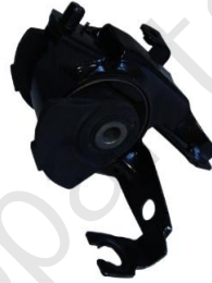
B25D-39-070 Engine Mount for Mazda 323 Protege Family LH AT MT