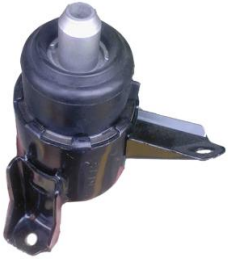
GJ6A-39-060 Engine Mount for Mazda M6 RL 2.3L 2003-2008

Email: manager@rbsautoparts.com Tel: +86-13222800878