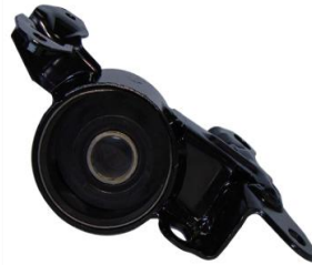
B596-39-100 Engine Mount for Mazda BG323 BA323 1.6L L4 MT 1990-1991