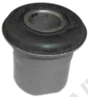
0680-28-330 AUTO RUBBER BUSHING FOR Mazda