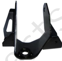
GJ6A-39-080 Engine Mount for Mazda M6 B70