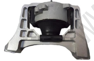
BBN3-39-060A Right Engine Mount for Mazda 3 2010-2013 Mazda 5 2012-2013