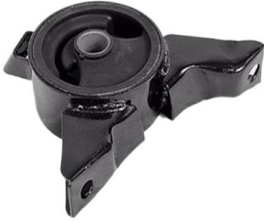
GG2A-39-060B EMT9469 A4401 Right Engine Mount Fits Mazda 626 2000-2002

Email: manager@rbsautoparts.com Tel:+86-13222800878