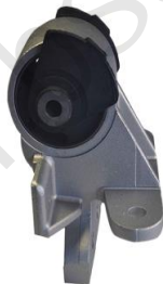
HB00-39-070 HBA0-39-070 Engine Mount for Mazda E18 B20