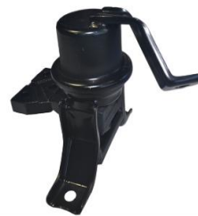
HMCA-39-06Y Engine Mount for Mazda