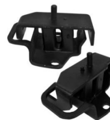
8-94482-405-0 8052 608579 Transmission Engine Motor Mounts Front Left Set 2.3 2.6