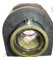
5-37516-005 Engine mount engine support for Isuzu