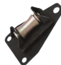
5-3459644-0 Engine mount engine support for Isuzu