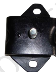
8-94155-652 LEFT Engine mount engine support for Isuzu