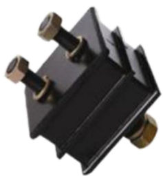
1-53215-039-0 Engine mount engine support for Isuzu V10 V295

Add: Unit 10, Mezzanine, No. 564, Jiahe Road, Huli District, Xiamen, China Email: manager@rbsautoparts.com Tel: +86-13222800878