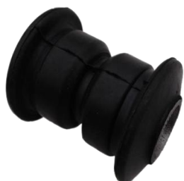
6-61333311-4 AUTO RUBBER BUSHING FOR Isuzu