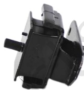
8-97187-417-0 ENGINE MOUNT FRONT LH FOR ISUZU