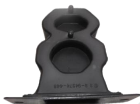
8-94374448 AUTO RUBBER BUSHING FOR Isuzu