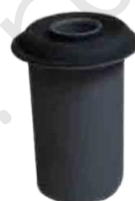
8-94408842 AUTO RUBBER BUSHING FOR Isuzu