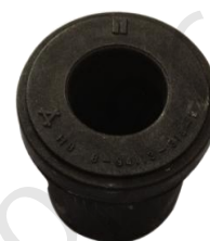
8-94113314-2 AUTO RUBBER BUSHING FOR Isuzu NPR NKR 1988