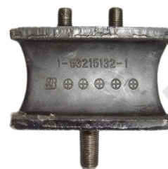
1-53215-132-1 Engine mount engine support for Isuzu V12 V330 340 10PE1