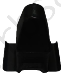
8-94150-265-3 AUTO RUBBER BUSHING FOR Isuzu