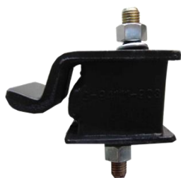
8-94111-903-0 Engine mount engine support for Isuzu NPR NKR (2)