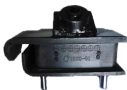
1-532253-313-0 1-532253-314-0 GEAR BOX MOUNTING FOR ISUZU FSR LH