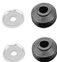
932902 strut mount for Isuzu Impulse 90-92