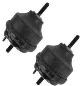
3178158697 Engine Mount Front PAIR Set for Isuzu

Add: Unit 10, Mezzanine, No. 564, Jiahe Road, Huli District, Xiamen, China Email: manager@rbsautoparts.com Tel: +86-13222800878