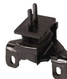
8-97039-189-2 Engine mount engine support for Isuzu D-MAX TFR 2800 Trooper 4 JG