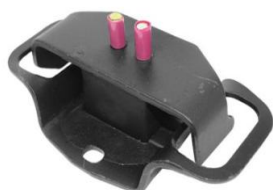
841257100514 Engine Motor Mount Front Left or Right 2.2 L For Isuzu Pickup L4