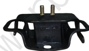
8-97029-579-0 Engine mount engine support for Isuzu