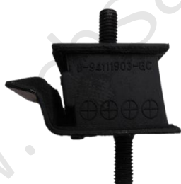
8-94111-903-GC Engine mount engine support for Isuzu