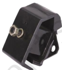
1-53215-048-0 Engine mount engine support for Isuzu JCM 6BB1 4BC2