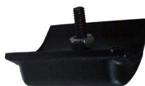
8-94119-958-1 Engine mount engine support for Isuzu NPR 97 NQR 97