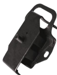
8-94375-284-0 Engine mount engine support for Isuzu Pickup RH LH