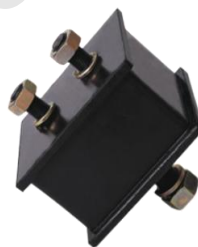
1-53215-061-0 Engine mount engine support for Isuzu V12 V330 340 10PE1 JUMBO 200