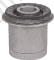
8-94118588-1 AUTO RUBBER BUSHING FOR Isuzu NKR 1995 NPR 1995-1997 NPR 120