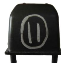
8-94433673-0 AUTO RUBBER BUSHING FOR Isuzu TFR