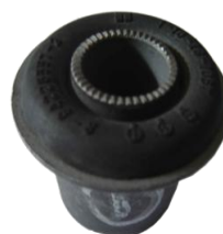
8-94226-557-2 AUTO RUBBER BUSHING FOR Isuzu