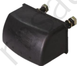
1-53366-025-0 1-53366-026-0 Engine mount engine support for Isuzu Jumbo Rocky 175