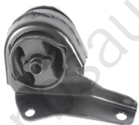
A5316 5316 MK5316 Front Right Engine Motor Mount For Isuzu